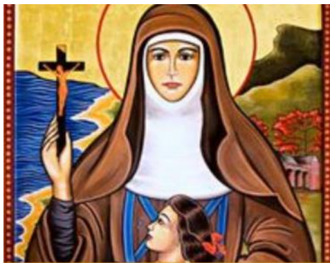
St Mary of the Cross Mackillop

St Lawrence, deacon, martyr St Clare, virgin